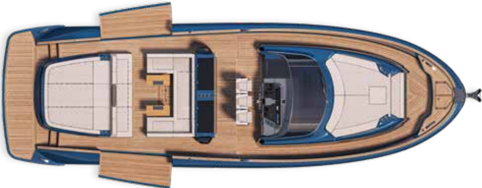
MAIN DECK A