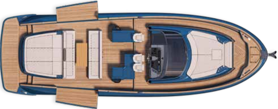
MAIN DECK B